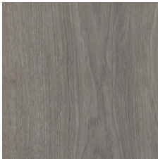
Traverse Oak 56760 V3 - Moderate Variation

Shade and texture variation is inherent in all resilient products and can vary significantly from piece to piece. Samples should be used to assess color.